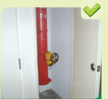
No storage of items within dry/wet riser compartment.