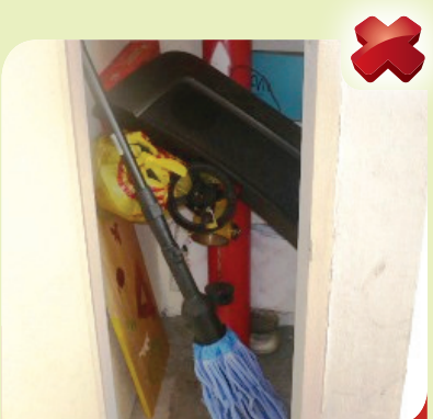
Storage of items within hosereel compartment.