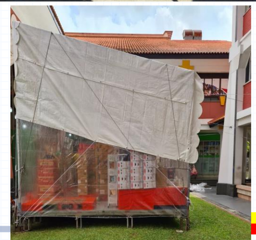
Examples of outdoor TP events