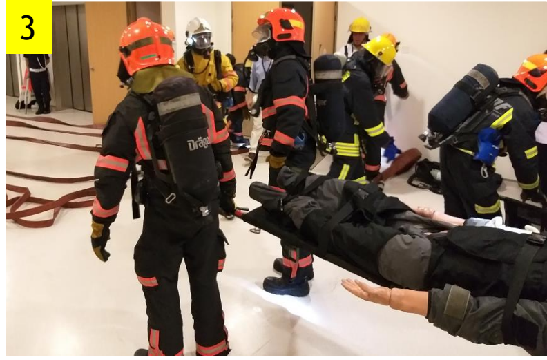
SCDF members carrying the (dummy) patient on a stretcher.