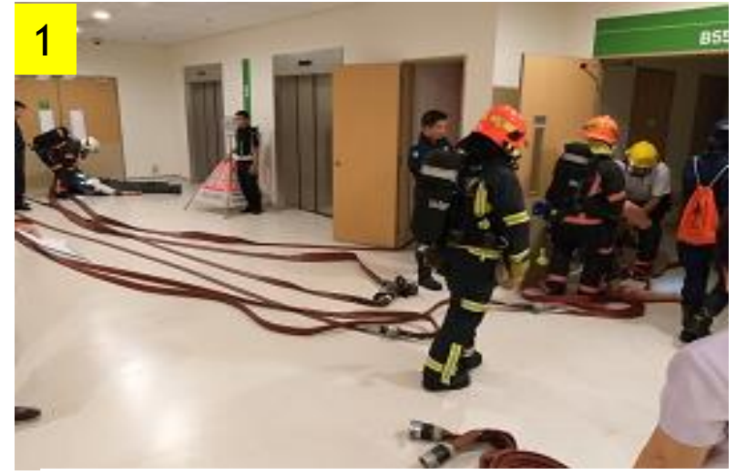
SCDF and CERT members were setting up the dry riser hoses.