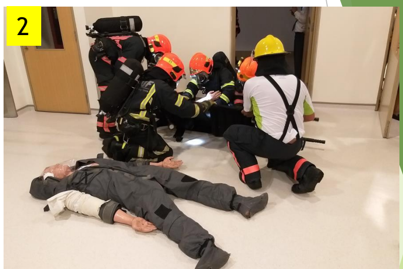
SCDF and CERT members rescued the (dummy) patient.