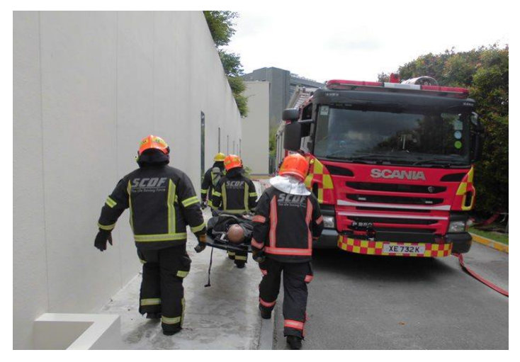
Joint Fire Drill Exercise With SCDF