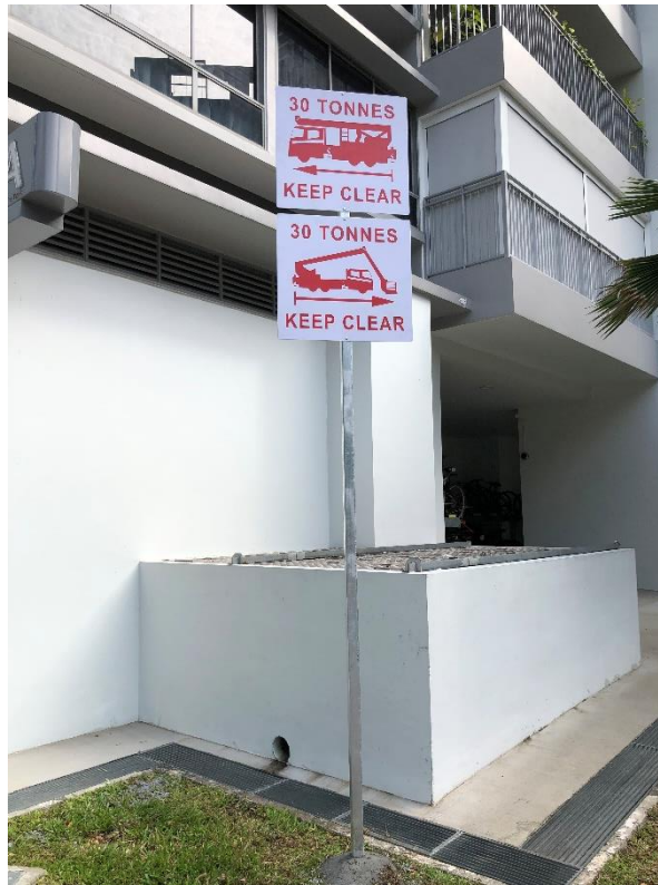
Figure 3: Example of signage