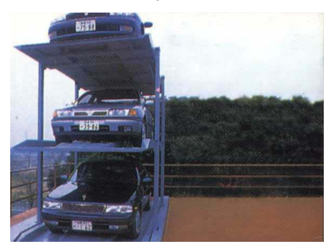
Category 1b: Small above ground with Decks Sunken

Minimum side openings : 50% of perimeter walls